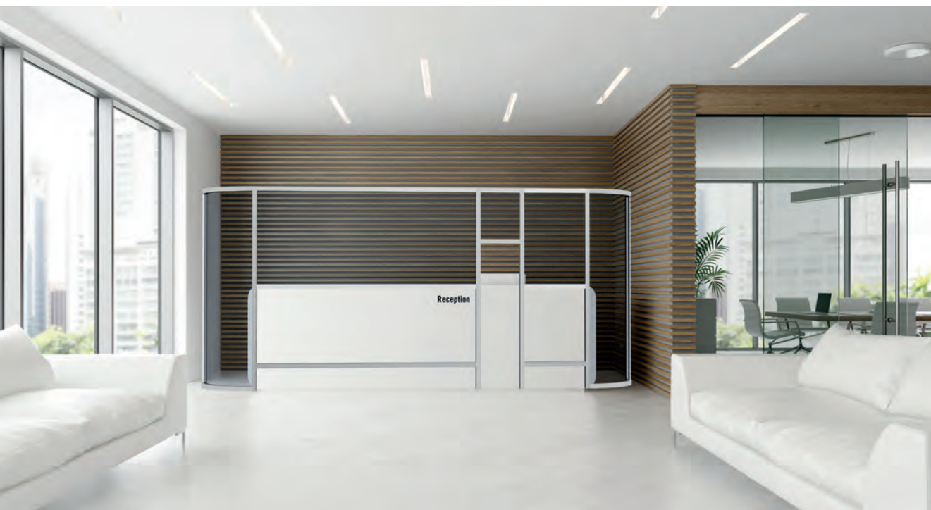
Hygiene protection with functional opening.