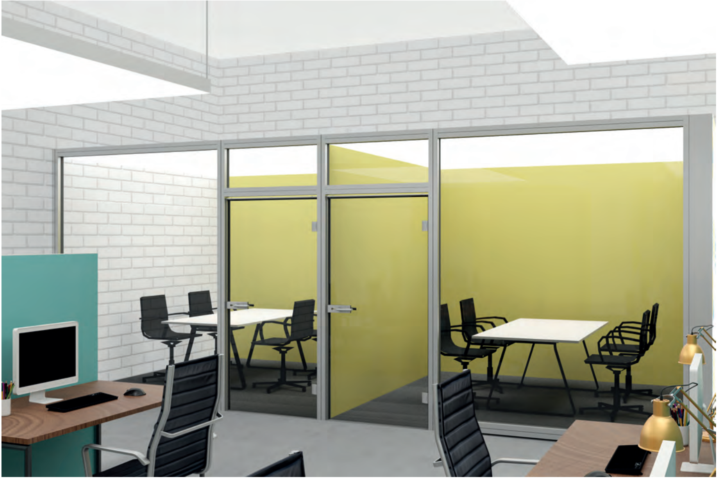
Fully separated rooms offer space for meetings