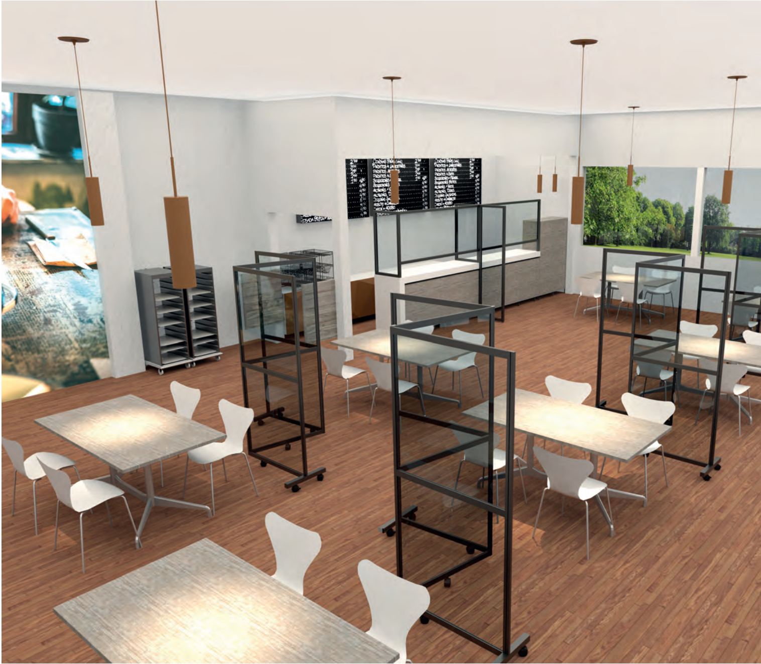
Space dividers allow cafeterias to be used even under strict hygiene requirements.