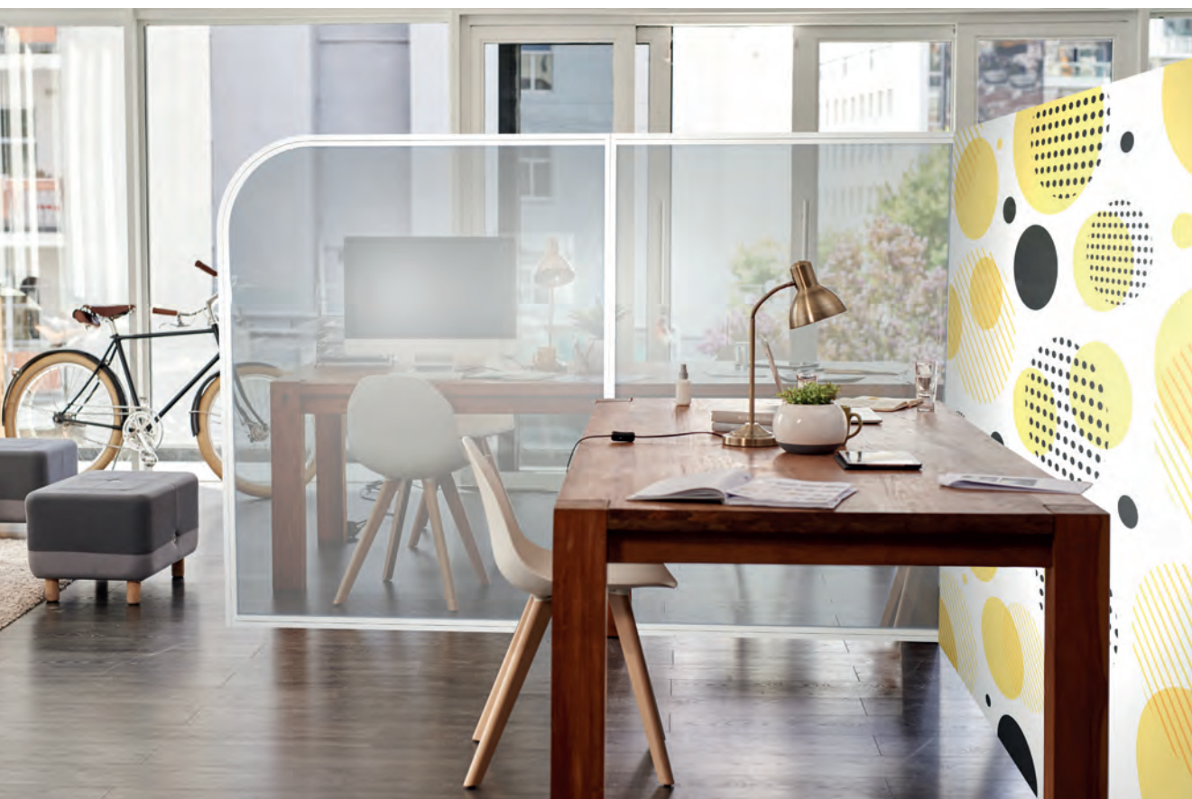
For video conferences: separating workspace from living space