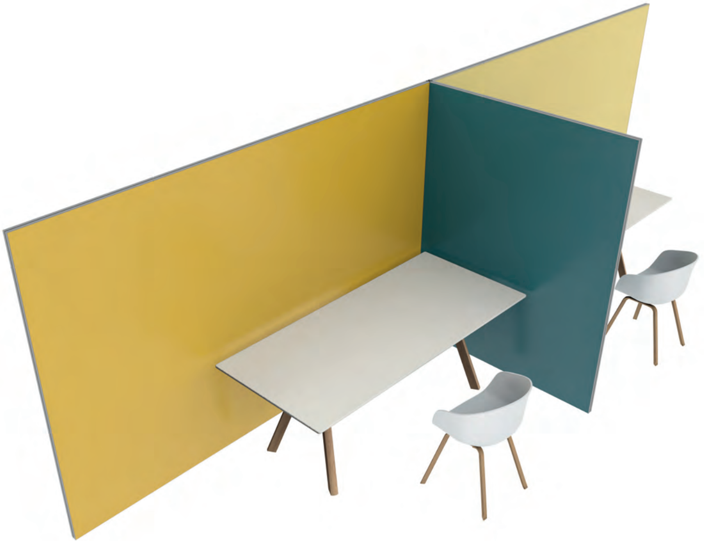
A wide variety of fabrics can be inserted into the fabric groove: from acoustic insulation mesh to antibacterial fabrics.