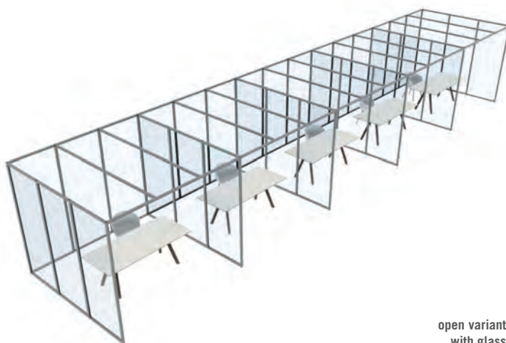
open variant with glass