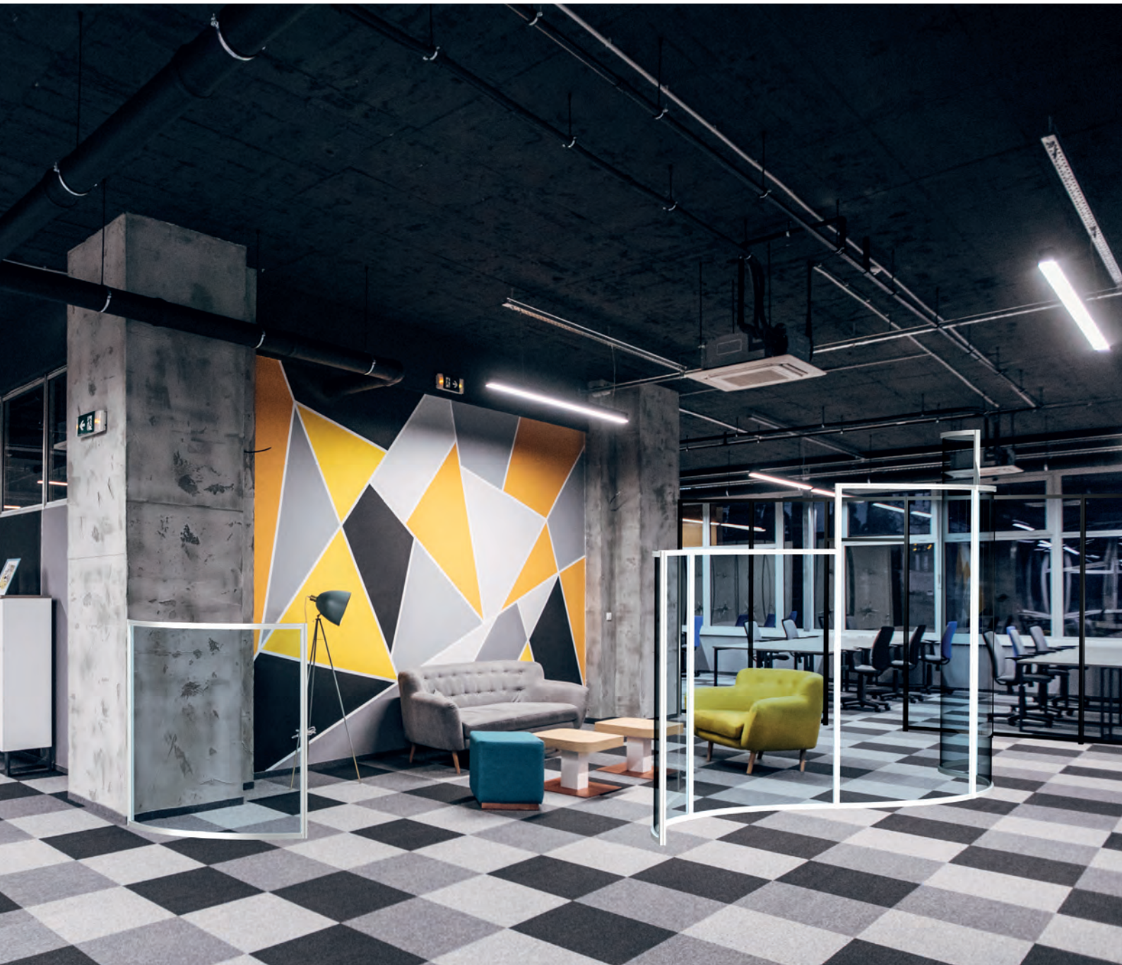
Shielded communal areas