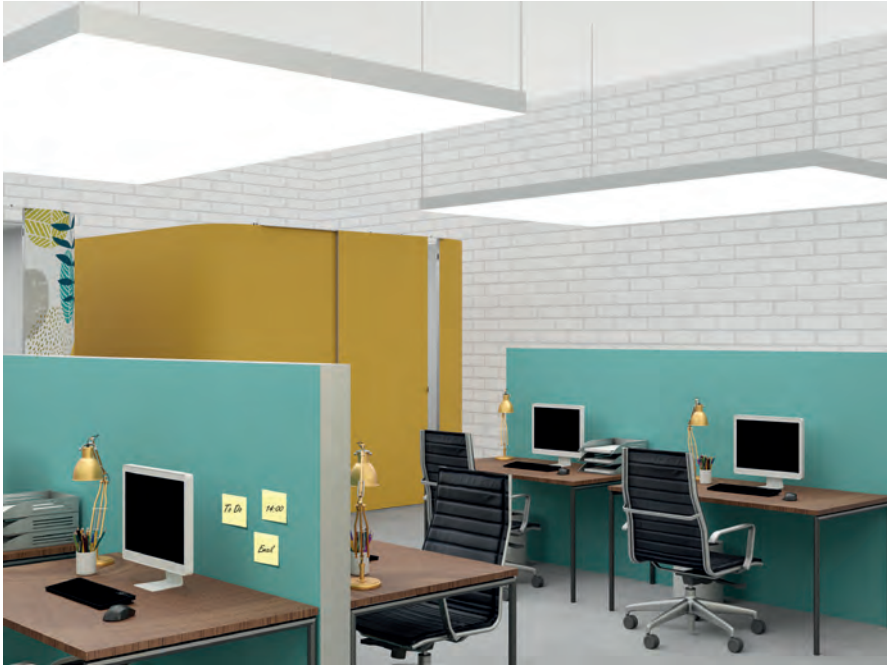
Partition walls create individual workspaces and ceiling mounted light frames provide uniform illumination.