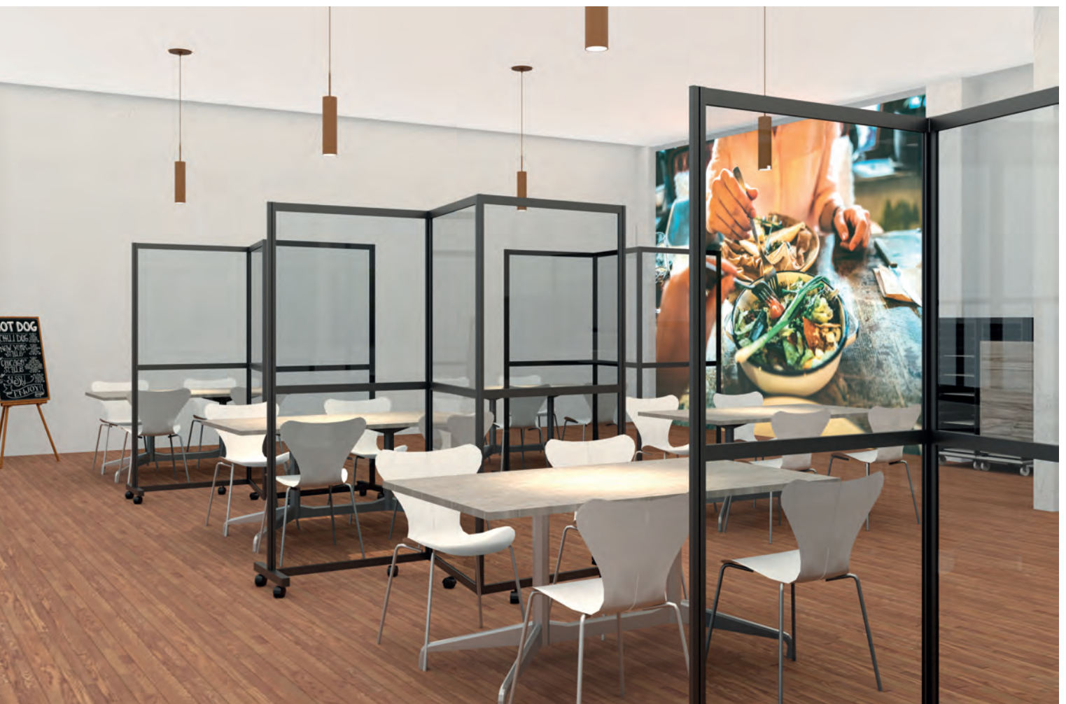
Creating a safe communal area