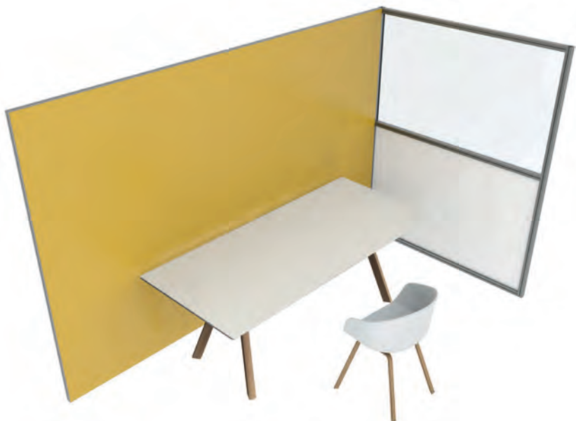
Different materials can be easily combined