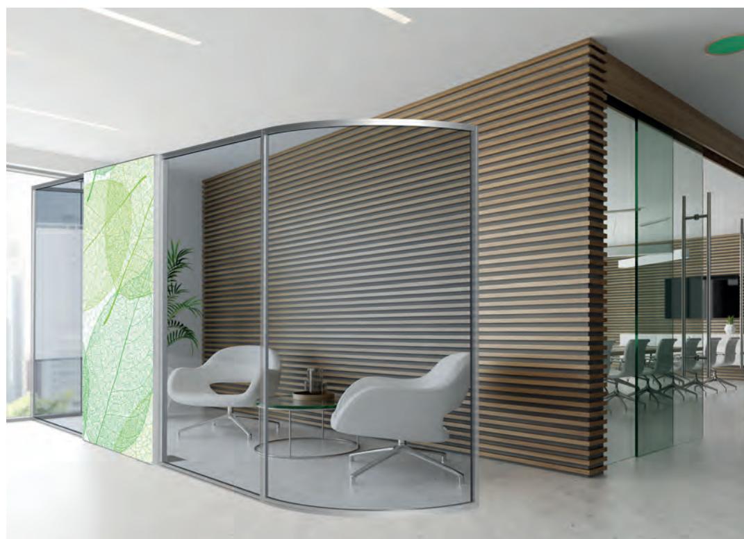
Our modular system constantly adapts to new requirements.