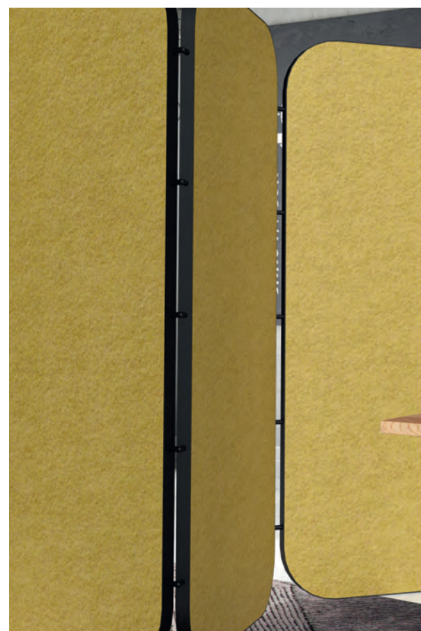
Cladded partition walls for a feel-good atmosphere