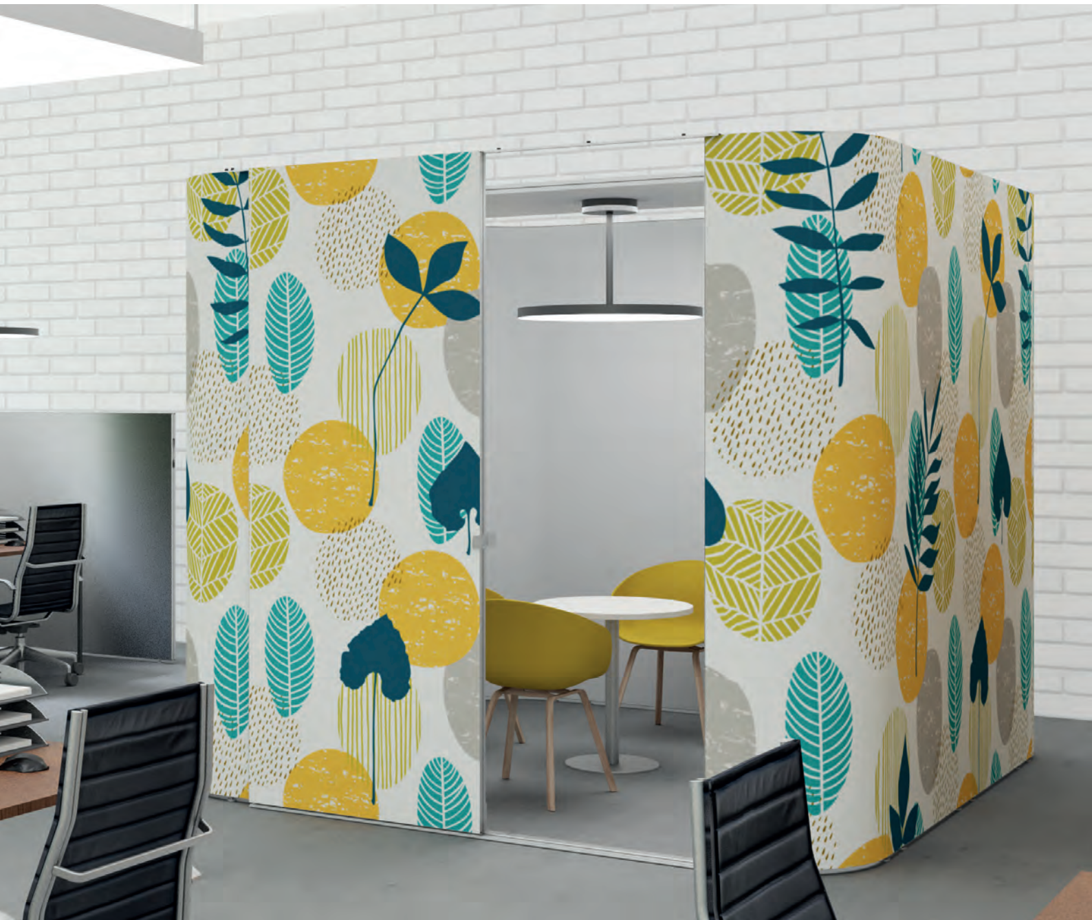
Small meeting room cabins with sliding doors can also be equipped with acoustic fabric.