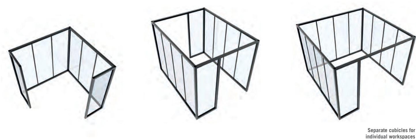
Separate cubicles for individual workspaces