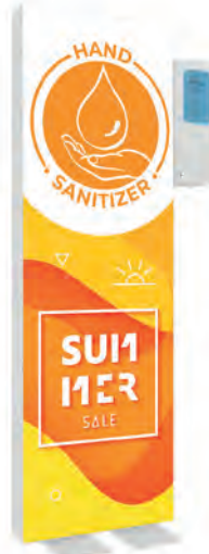
with illuminated advertising space