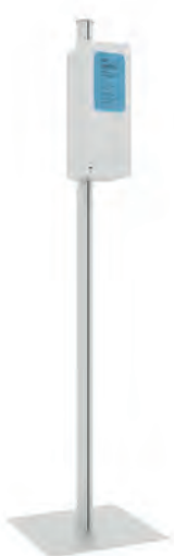
with floor stand

Antibacterial gels or wipes are not always at hand. In such cases, our mobile hand sanitizer stands enable customers and visitors to quickly disinfect their hands. A safe and secure feeling for them - and additional advertising space for you thanks to printed fabrics.