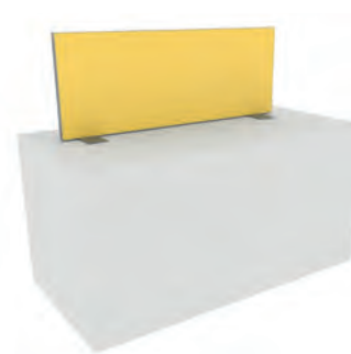
as tabletop partition