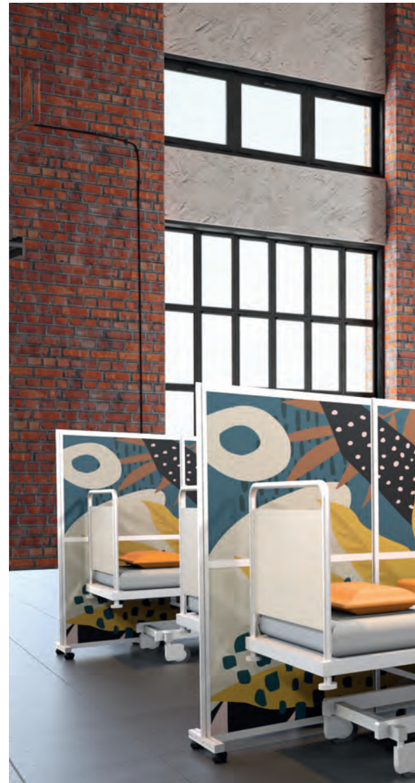
The folding walls are made of resistant, easy to clean material.

ALWAYS READY FOR SHORT-TERM CONVERSIONS.