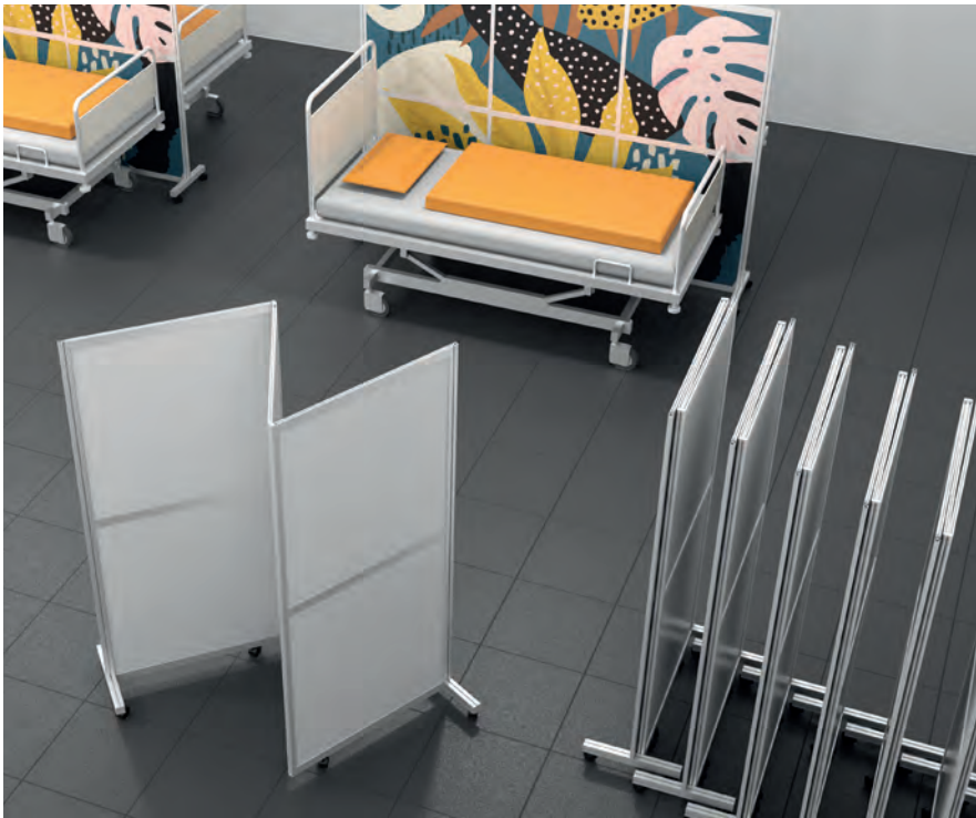
The mobile folding walls can be folded up to save space.

ALWAYS READY FOR SHORT-TERM CONVERSIONS.