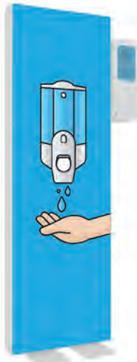
with advertising space