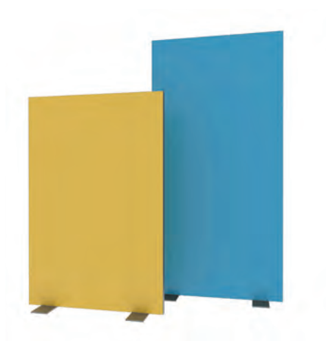
with base plates

Select from three different sizes and use directly. Whether as tabletop partitions, with base plates or castors, in offices, stores or public authorities - our partition walls offer a flexible solution for every field of application.