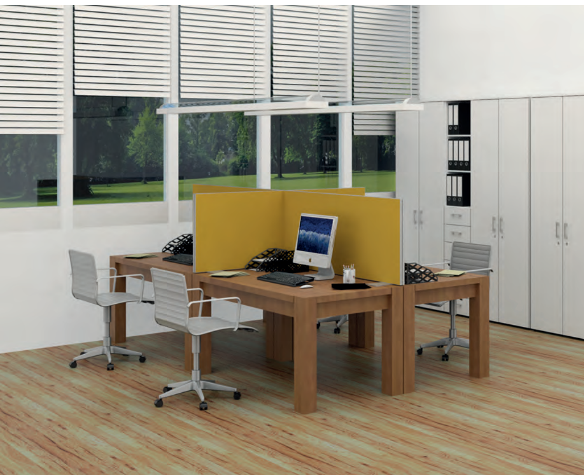
Partition wall modules as a flexible solution for the workplace.

Select from three different sizes and use directly. Whether as tabletop partitions, with base plates or castors, in offices, stores or public authorities - our partition walls offer a flexible solution for every field of application.